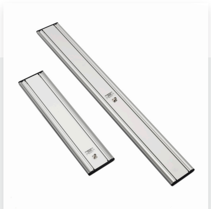
SFR4 back side