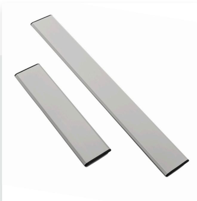
SFR4 front side